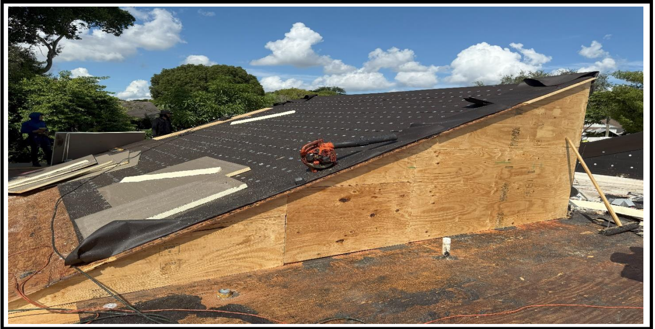
8 – Ongoing, replacement of existing damaged plywood, BLDG 13.