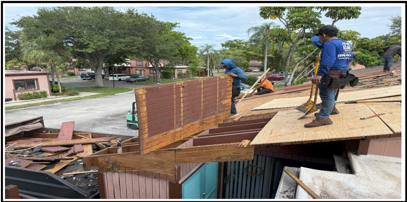
2 – Ongoing, replacement of damaged plywood, BLDG 6.