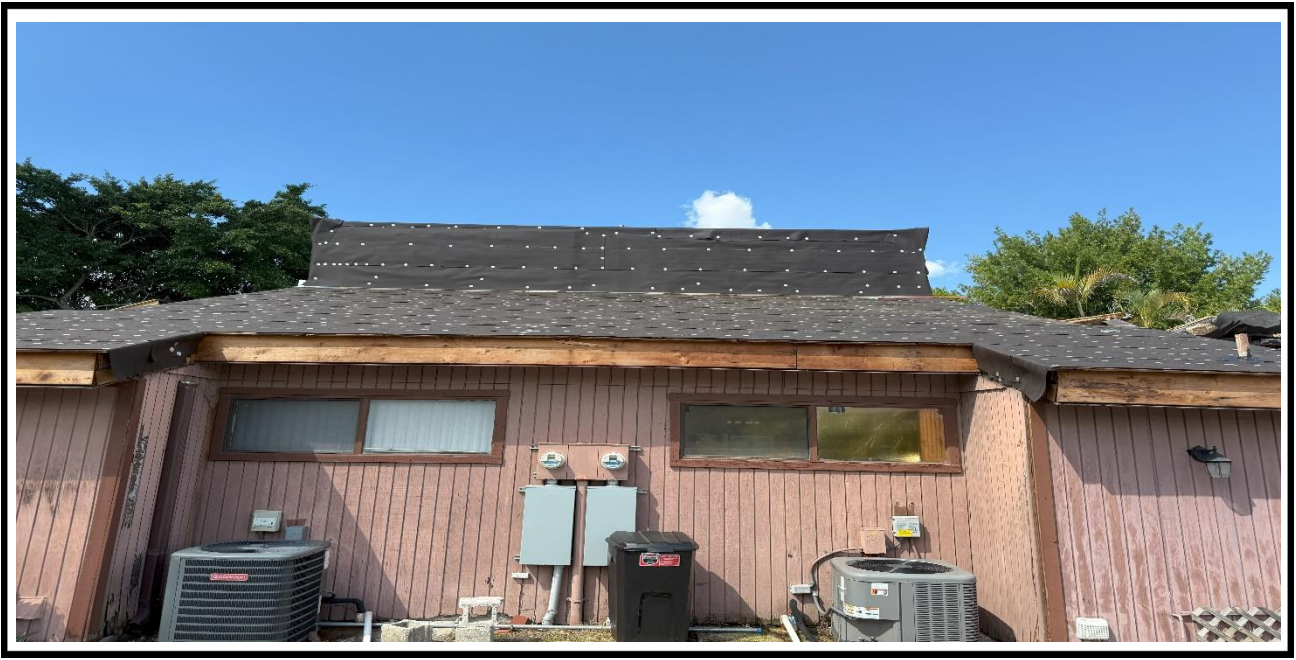
11 – Ongoing, placement of the black paper on top of plywood, BLDG 13.