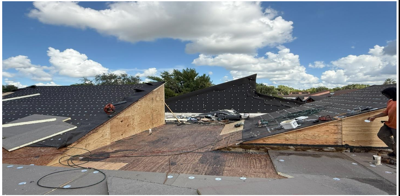
9 – Ongoing, replacement of existing damaged plywood, BLDG 13.