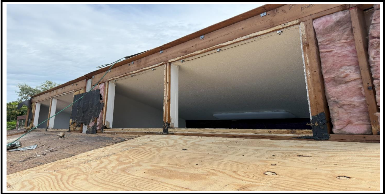
4 – Ongoing, removal of the existing roofing cover material and damaged plywood, BLDG 6.