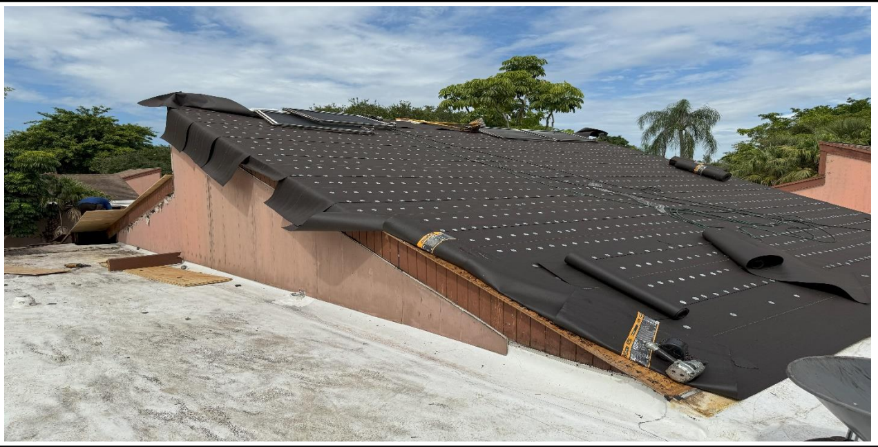
6 – Ongoing, placement of the black paper on top of plywood, BLDG 6.