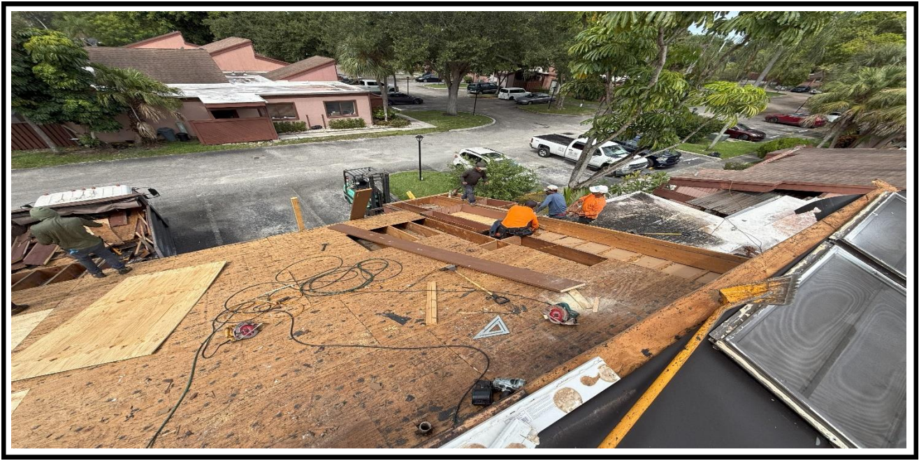
1 – Ongoing, removal of the existing roofing cover material and damaged plywood, BLDG 6.