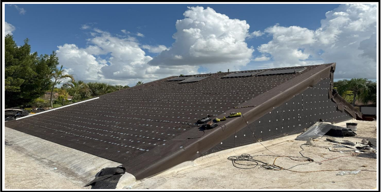
12 – Ongoing, placement of the black paper on top of plywood, BLDG 13.