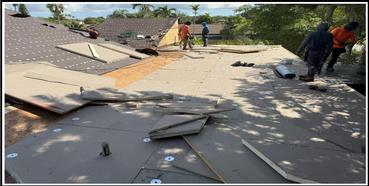
10 – Ongoing, replacement of existing damaged plywood, BLDG 13.