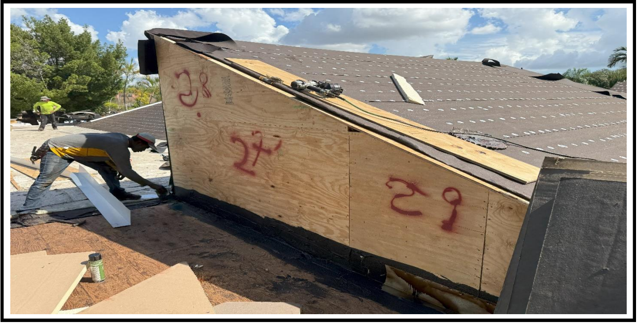
7 – Ongoing, replacement of existing damaged plywood, BLDG 13.