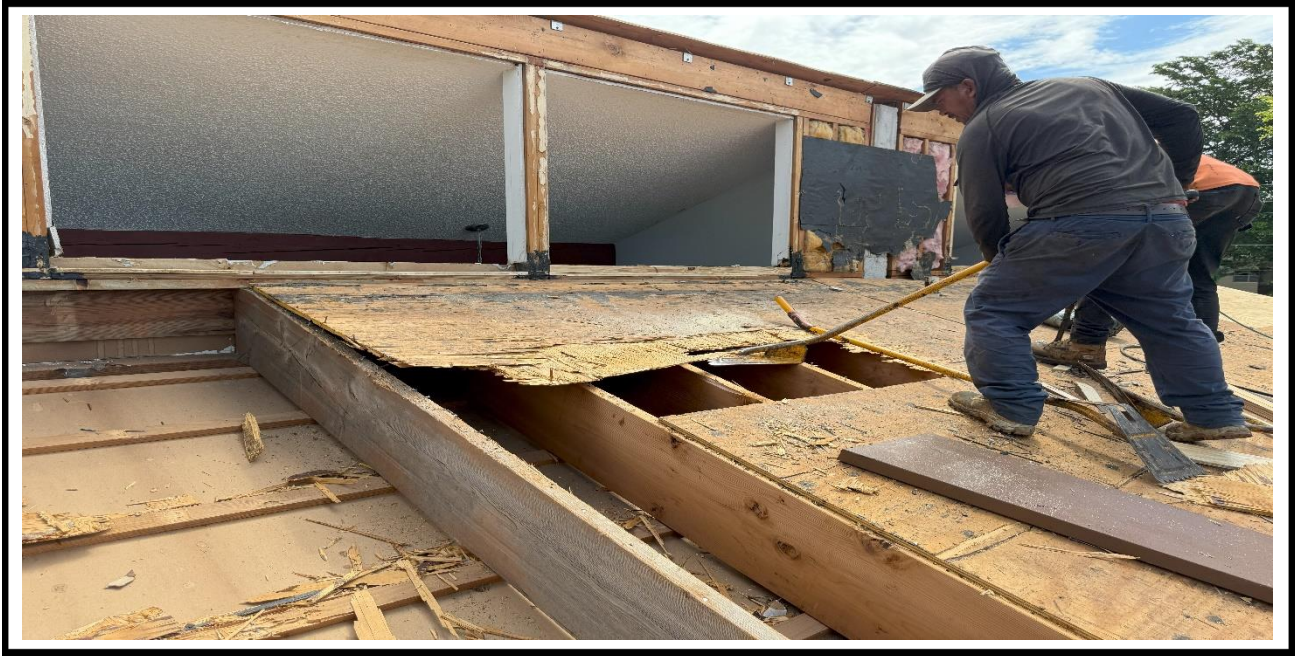
3 – Ongoing, removal of the existing roofing cover material and damaged plywood, BLDG 6.v