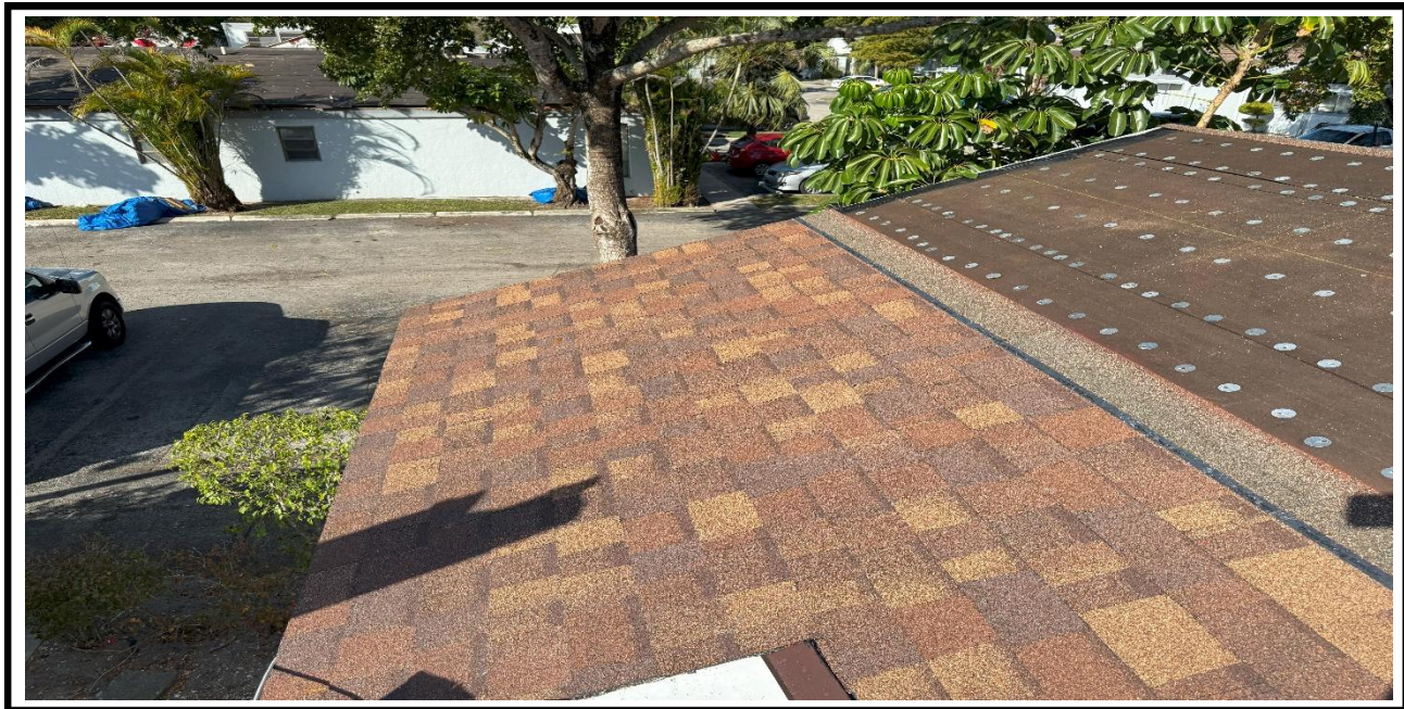
10 – Ongoing, Installation of the new roofing shingles , BLDG 07.