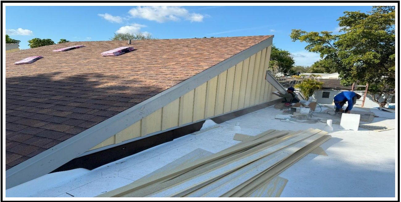
16 – Ongoing, Installation of Hardie boards and Hardie trims, BLDG 07.