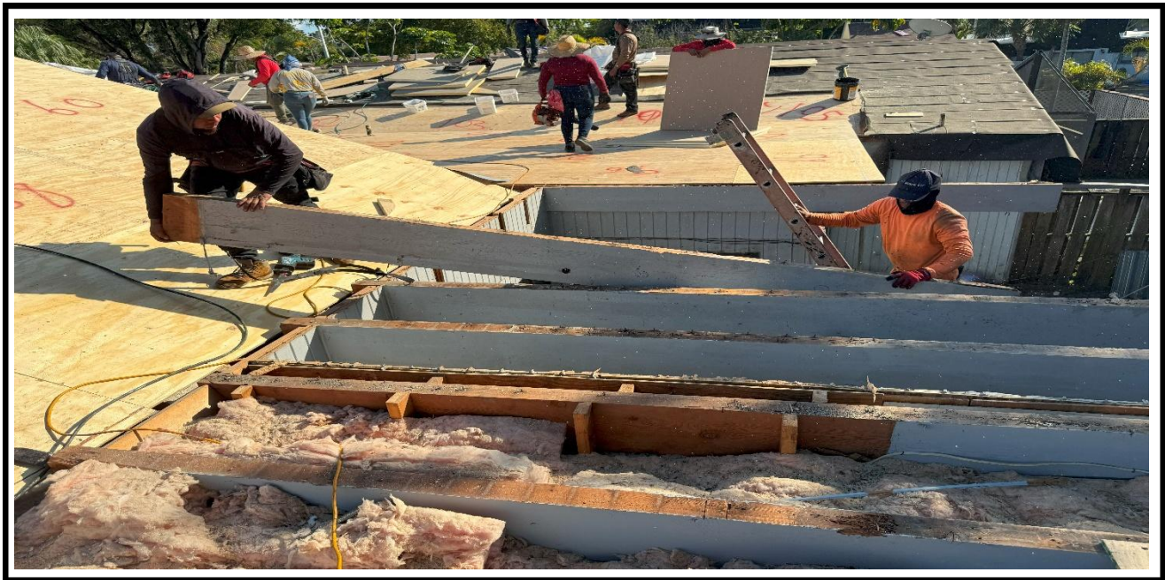
2 – Ongoing, removal of the deteriorated wooden beams and installation of the new beams, BLDG 8.