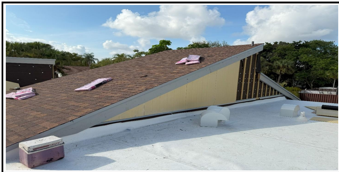
14 – Ongoing, Installation of Hardie Board over the wooden strips, BLDG 14.