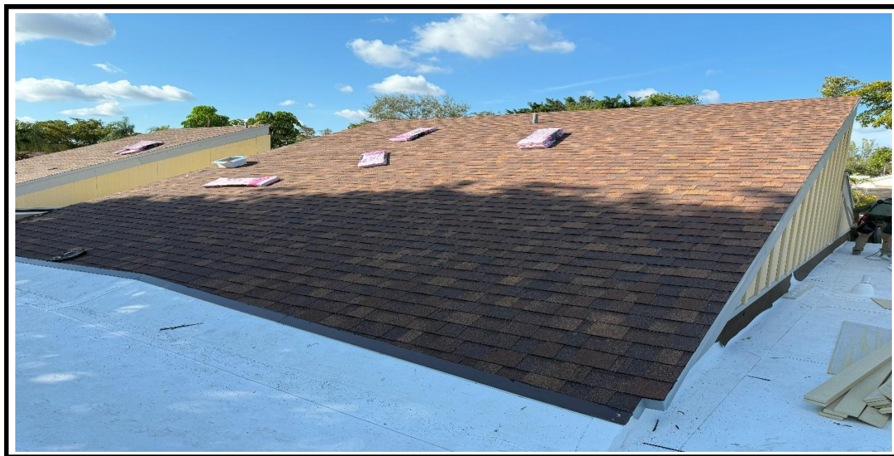
12 – Ongoing, Installation of the new roofing shingles, metal drip edges and fascia board , BLDG 07.