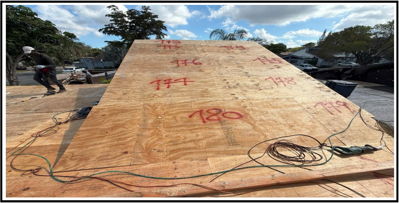
3 – Ongoing, removal of the deteriorated plywood and installation of the new plywood, BLDG 8.