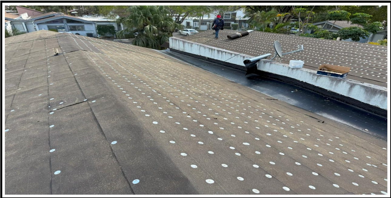
5 – Ongoing, Laying down the waterproofing black sheets and tin caps, BLDG 8.