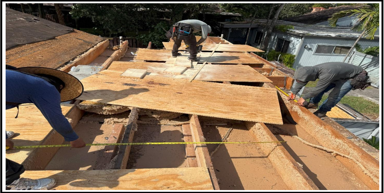
4 – Ongoing, removal of the deteriorated plywood and installation of the new plywood, BLDG 8.