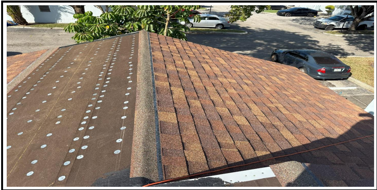
9 – Ongoing, Installation of the new roofing shingles , BLDG 07.