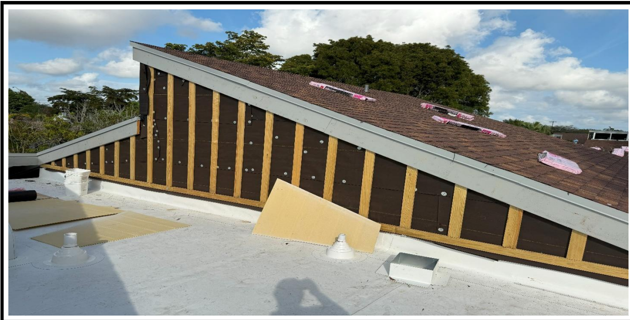
13 – Ongoing, Installation of wooden strips over the waterproof paper , BLDG 7.