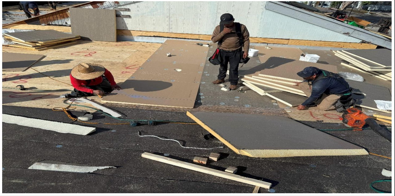
7 – Ongoing, Laying down the insulation sheets and tin caps, BLDG 8.