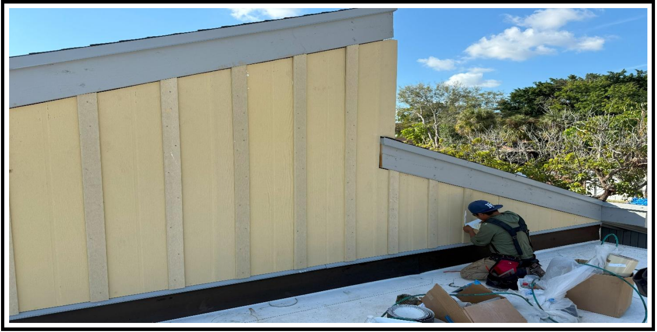
15 – Ongoing, application of the caulking at the Hardie trims, BLDG 07.