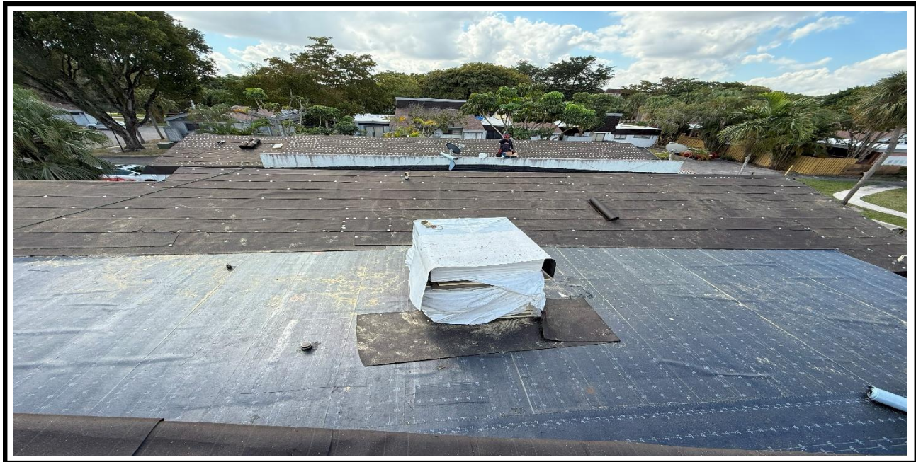
6 – Ongoing, Laying down the waterproofing black sheets and tin caps, BLDG 8.