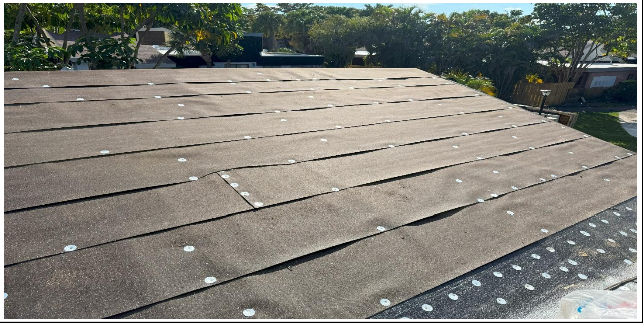
8 – Ongoing, Laying down the waterproofing black sheets and tin caps, BLDG 8.