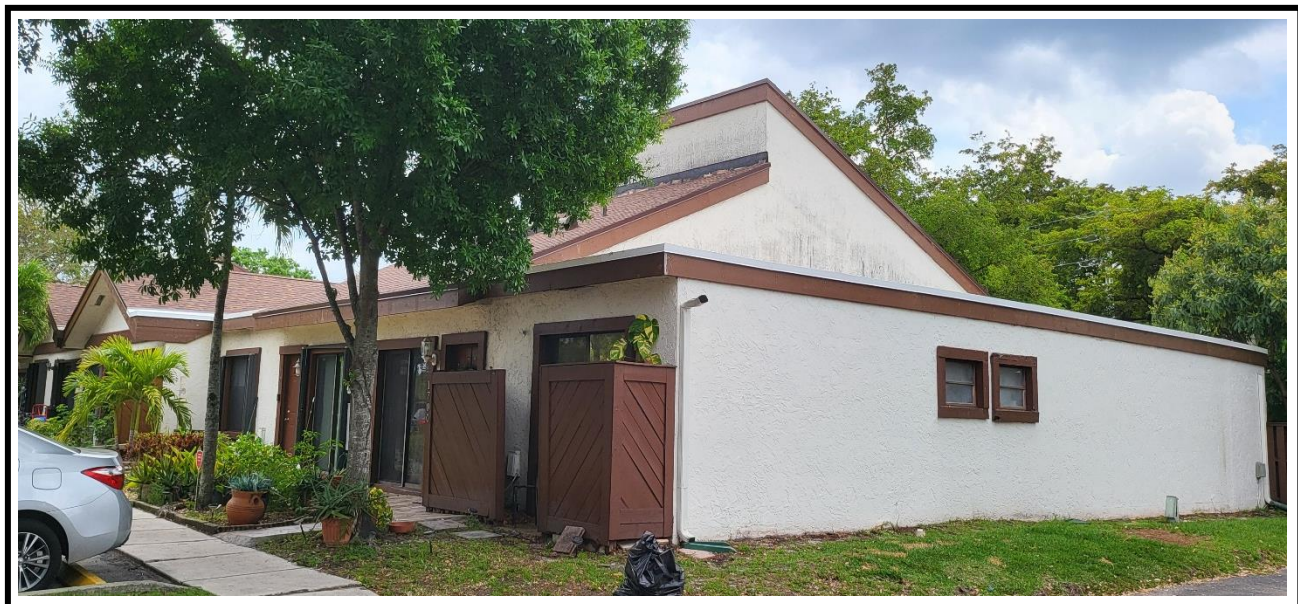
6 – Application of wood filler material and paint at fascia board