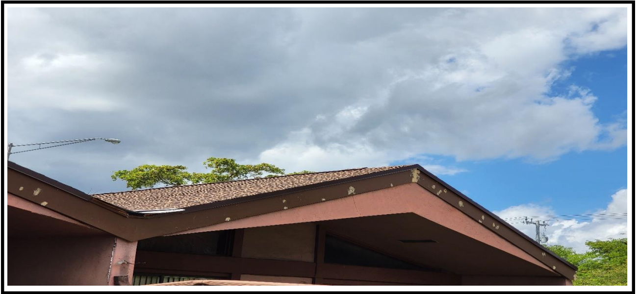
1 – Ongoing application of the wood filler material at fascia board