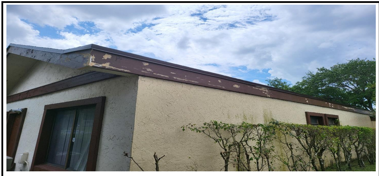
5 – Ongoing application of wood filler material at fascia board