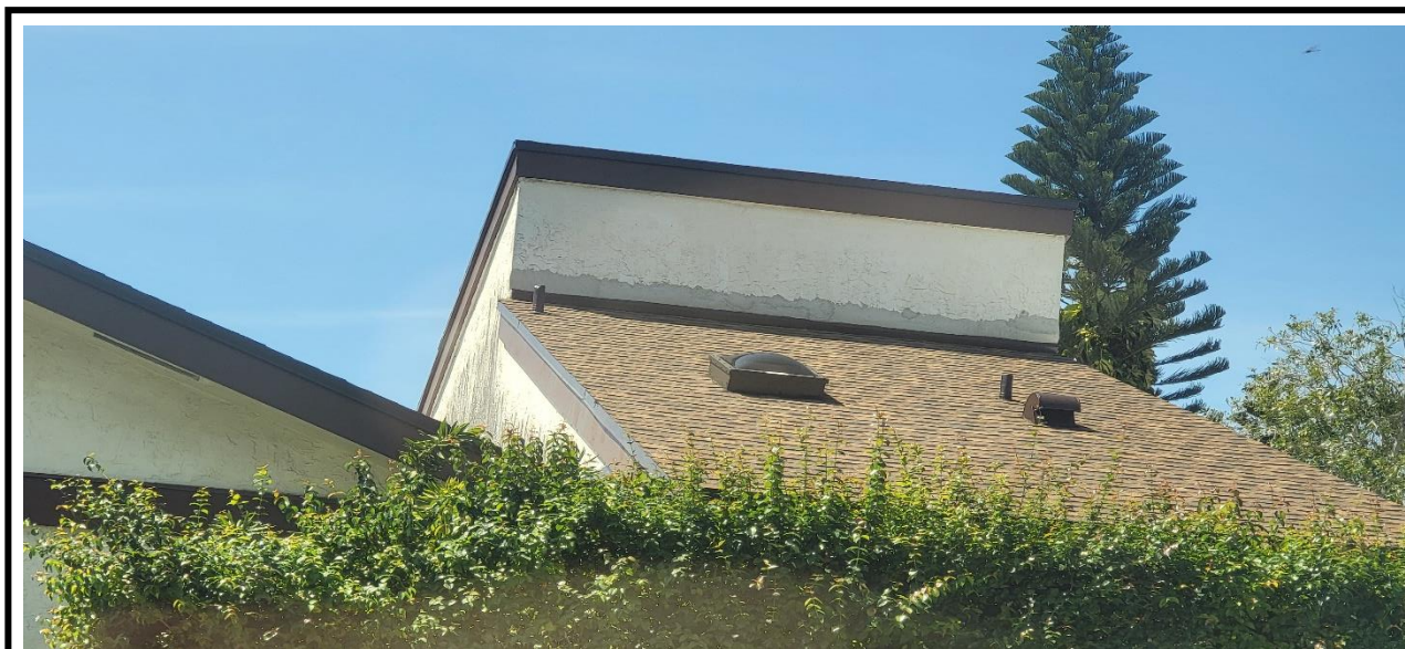
4 – Observed, ongoing, installation of Counter Flashing and Stucco Repair at Exterior Wall