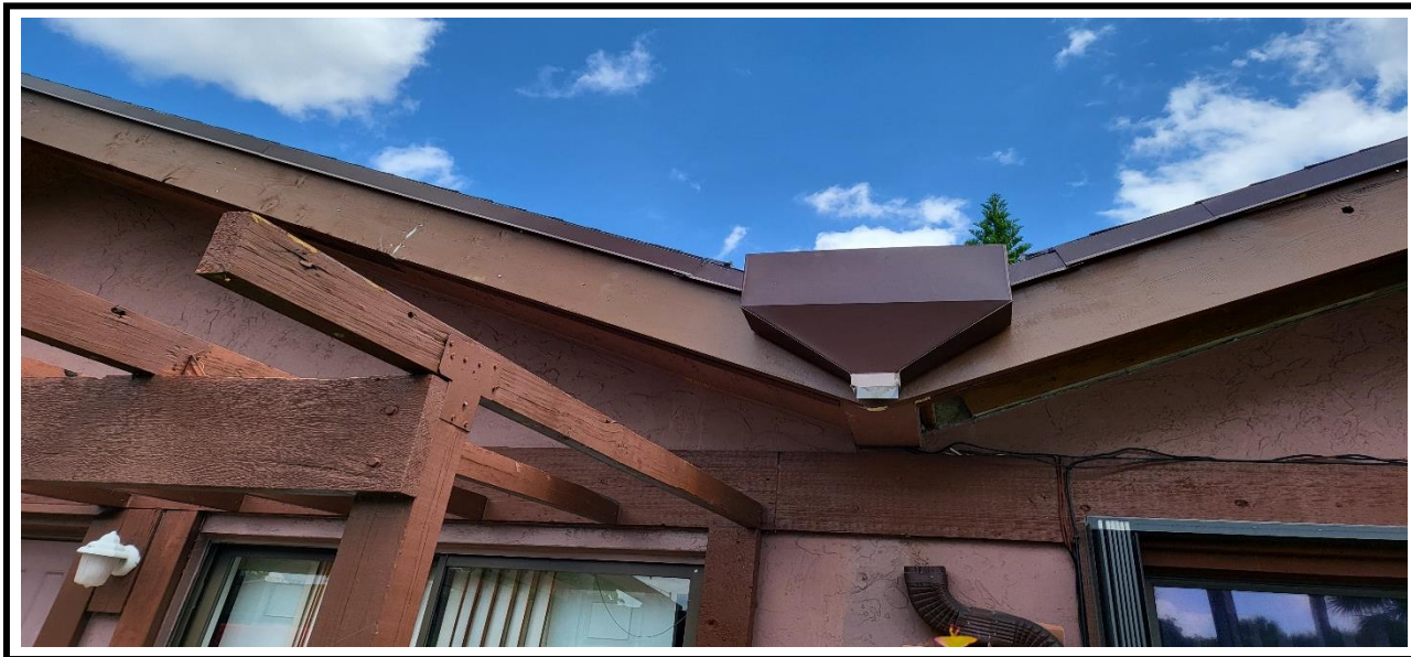
3 – Observed, ongoing, installation of water collection system and drip edges