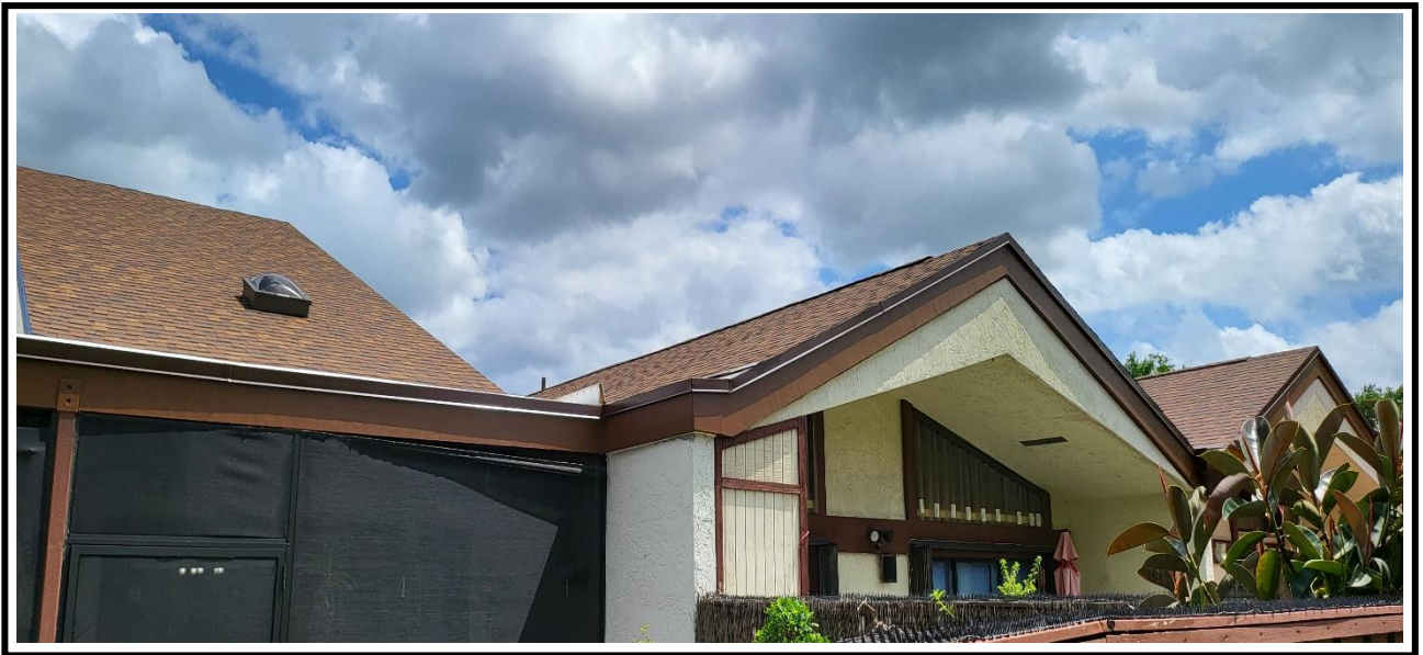
2 – Observed the application of paint layer on fascia board and drip edges