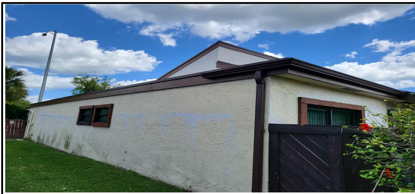
8- Application of Final Paint Layer on Gutter System and Facia Board