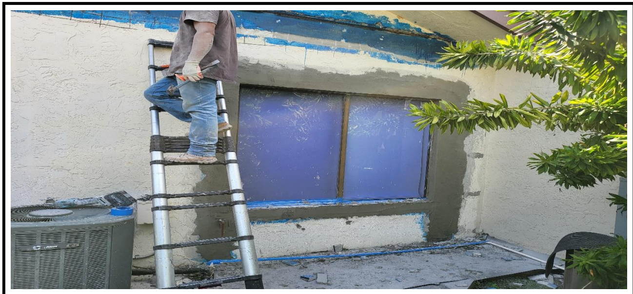
7 – Cutting and chipping of the delaminated and cracked stucco at the exterior walls.