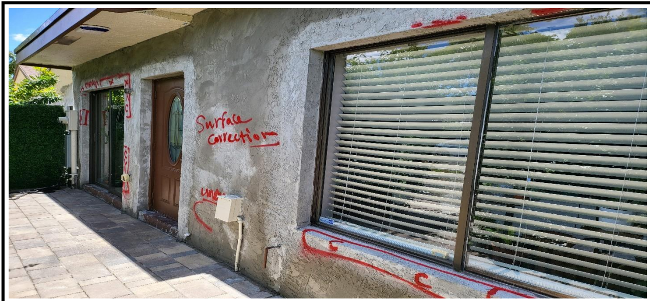
5 – Ongoing, Inspection of the new stucco at the exterior walls.