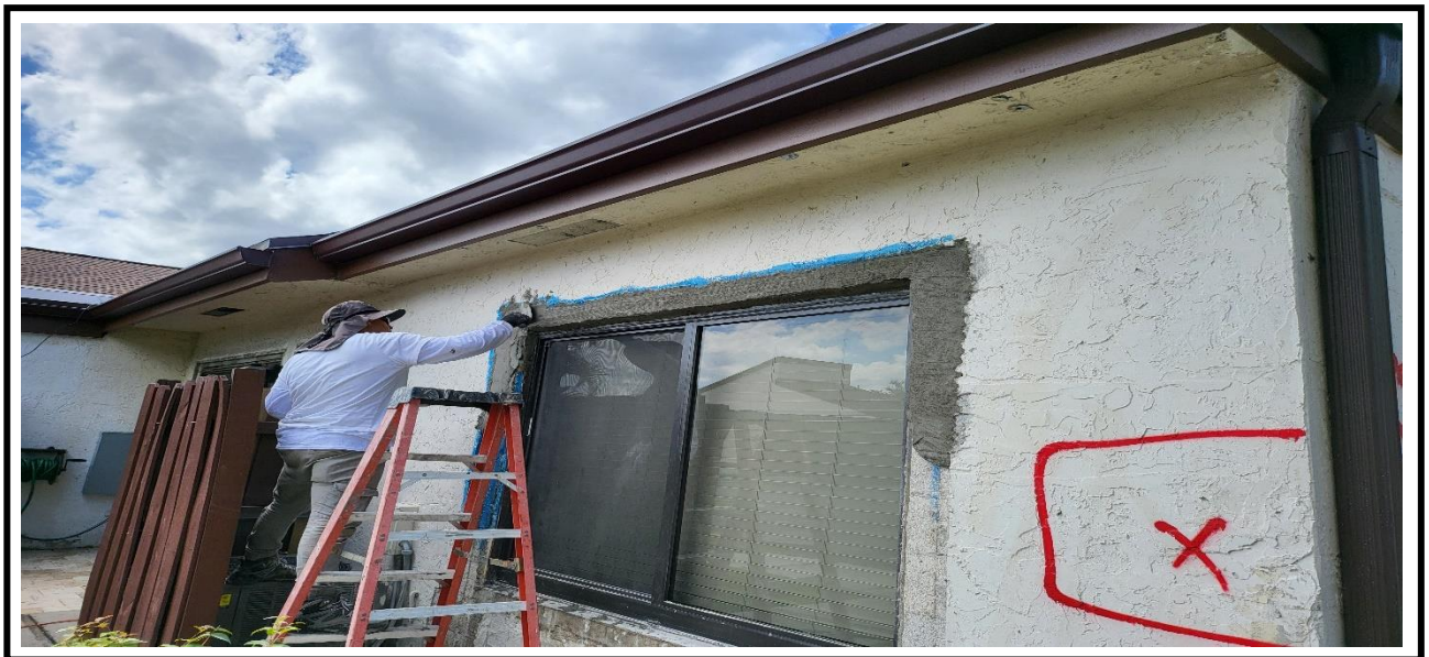
2 – Ongoing, Application of the new stucco at the exterior walls, around the window's perimeter.