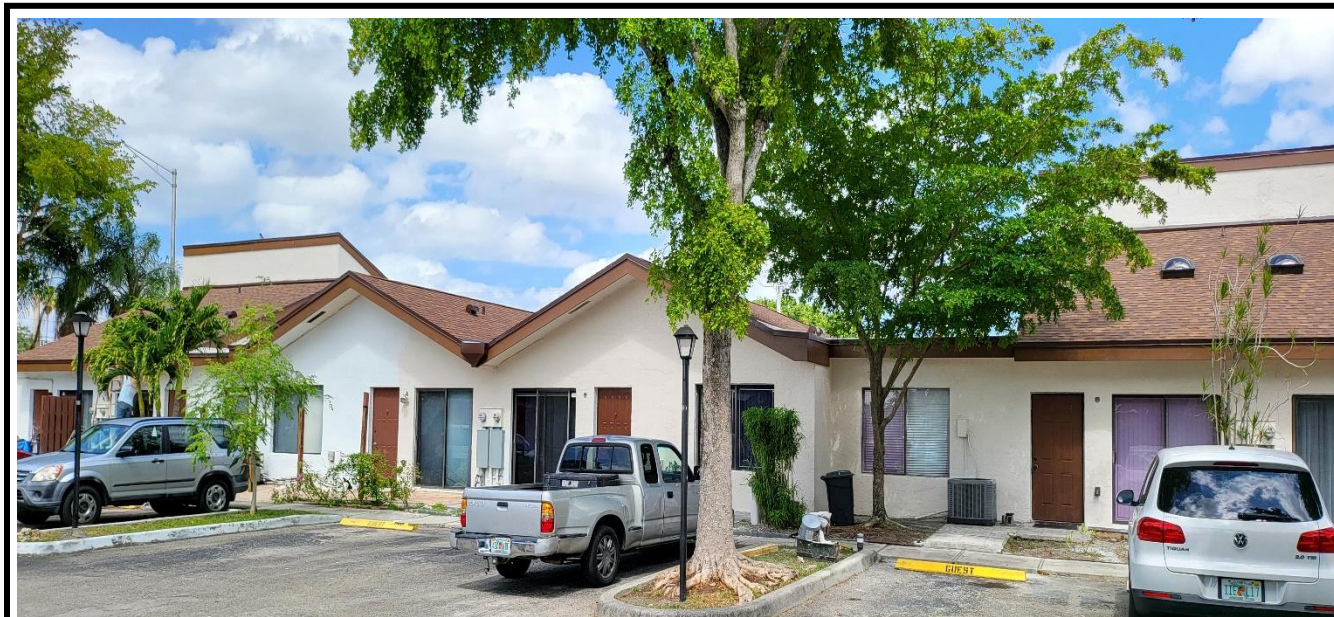
10 - Application of the new primer and paint at the exterior walls.