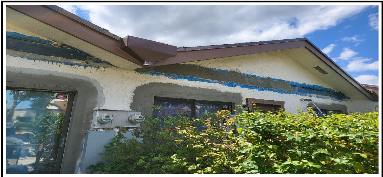
4 – Ongoing, Application of the bonding agent and the new stucco at exterior walls.