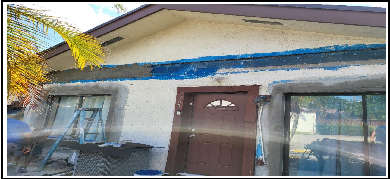
3 – Ongoing, Application of the bonding agent and the new stucco at exterior walls.