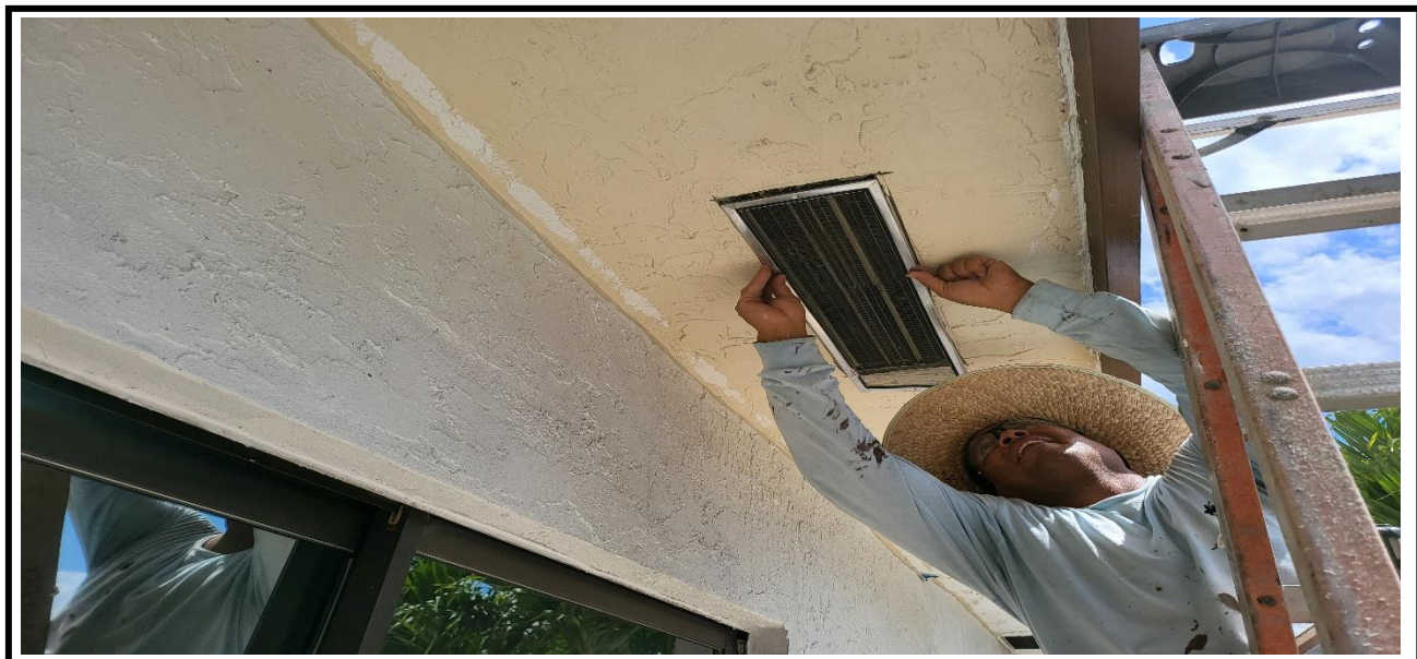
8 – Ongoing, installation of the roof vent cover.