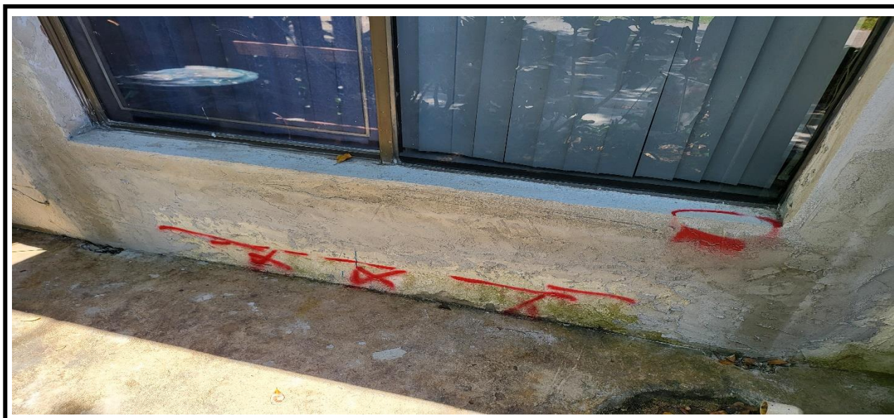
6 – Ongoing, Inspection of the new stucco at the exterior walls.