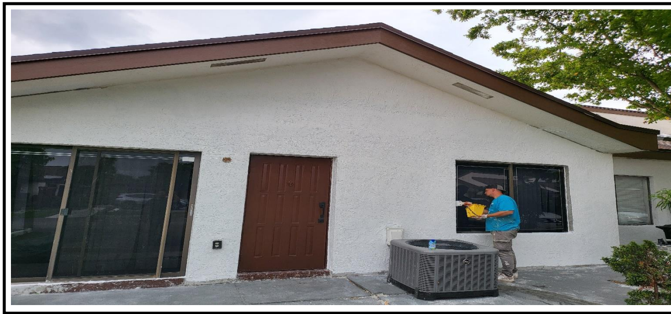
9 – Ongoing, Application of the new primer and paint at the exterior walls.